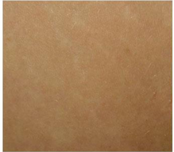
Before and after treatment