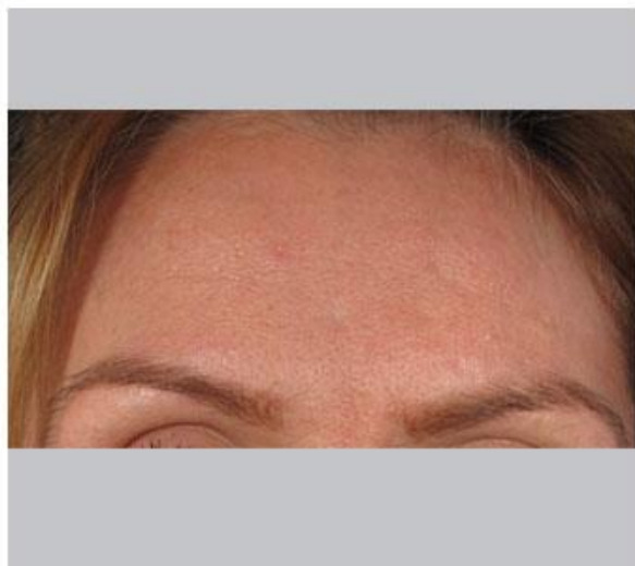
Before and after treatment