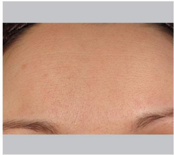
Before and after treatment