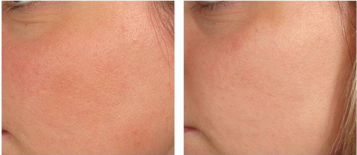
Before and after treatment