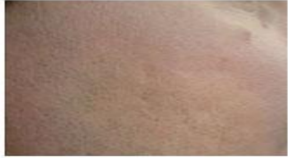
Before and after treatment